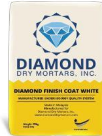
Diamond Finish Coat White