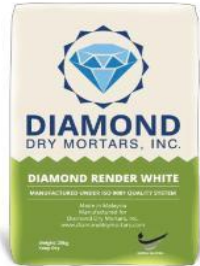
Diamond Render White

The products are packed in 25 kg or 40 kg bags. Just add water and the material is ready for use