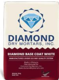
Diamond Base Coat White